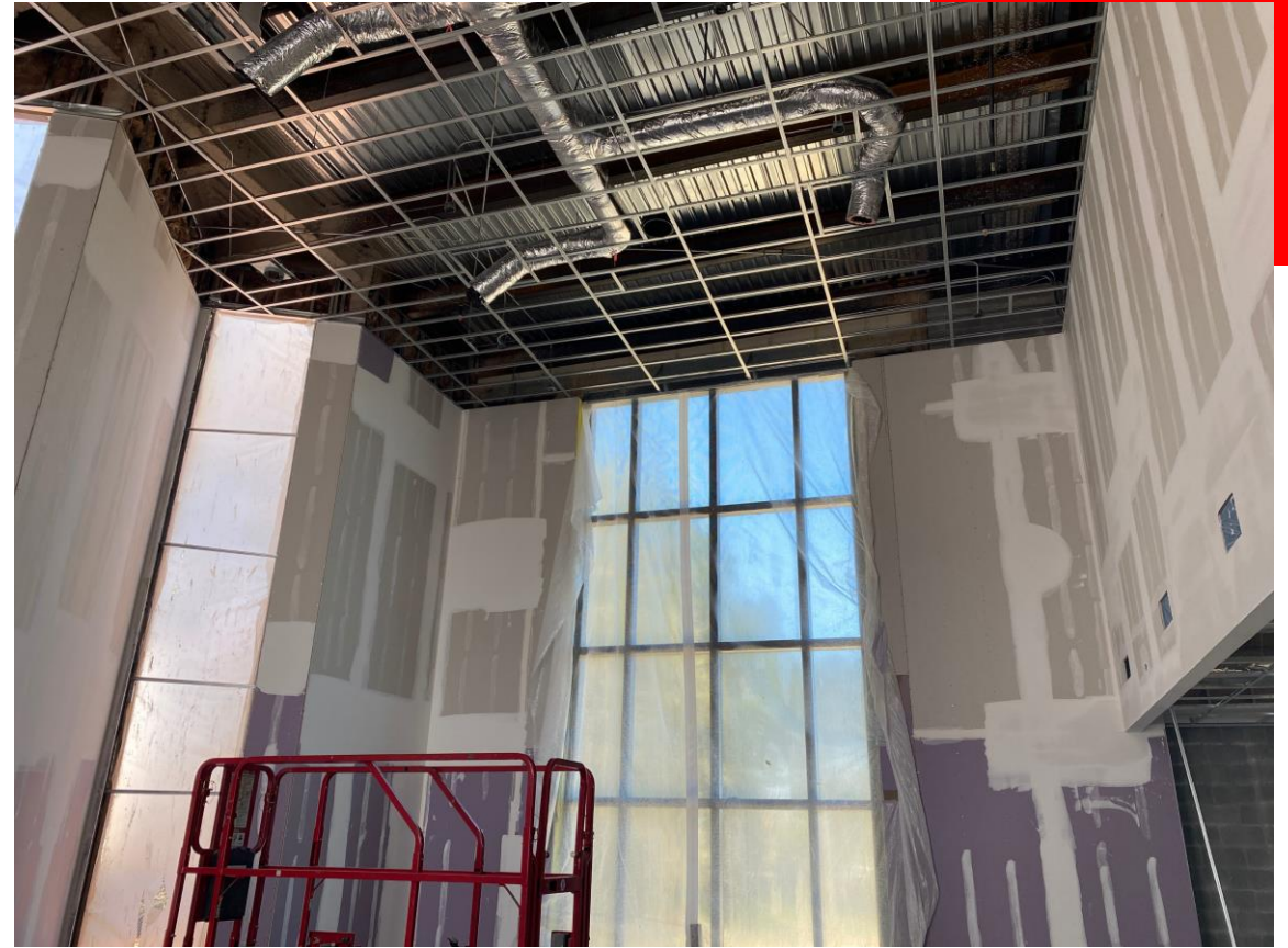
Gypsum Board Progress in Media Center Double Height Space