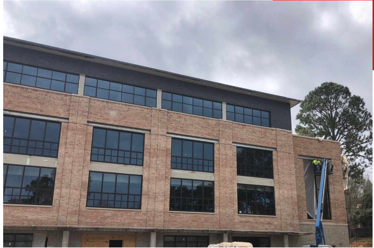
New Addition Progress – North Elevation