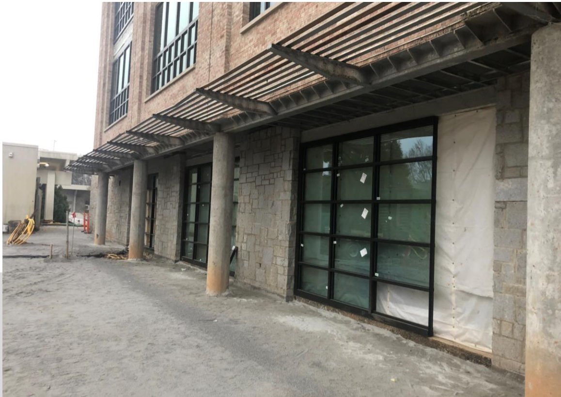
North Elevation Grading Progress