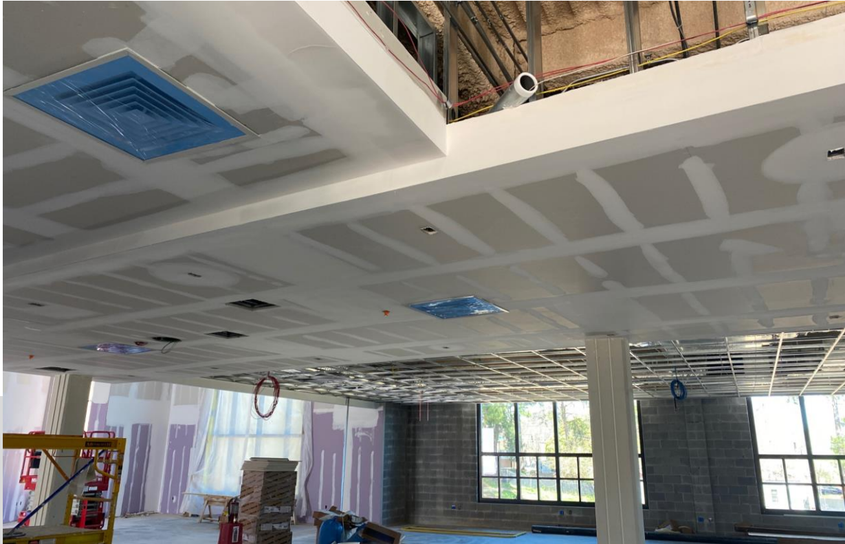
Gypsum Board Progress at Lower Media Center Ceilings