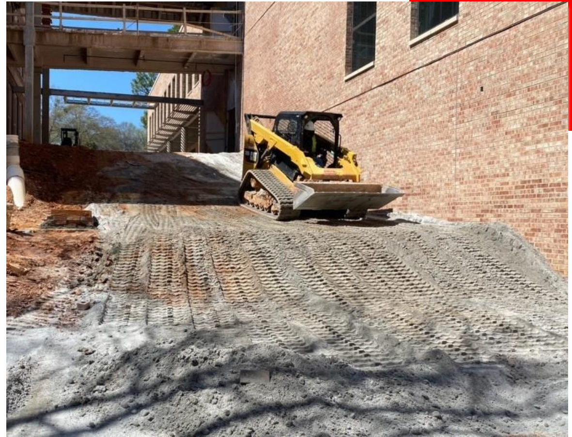
Hardscape Progress South East Elevation