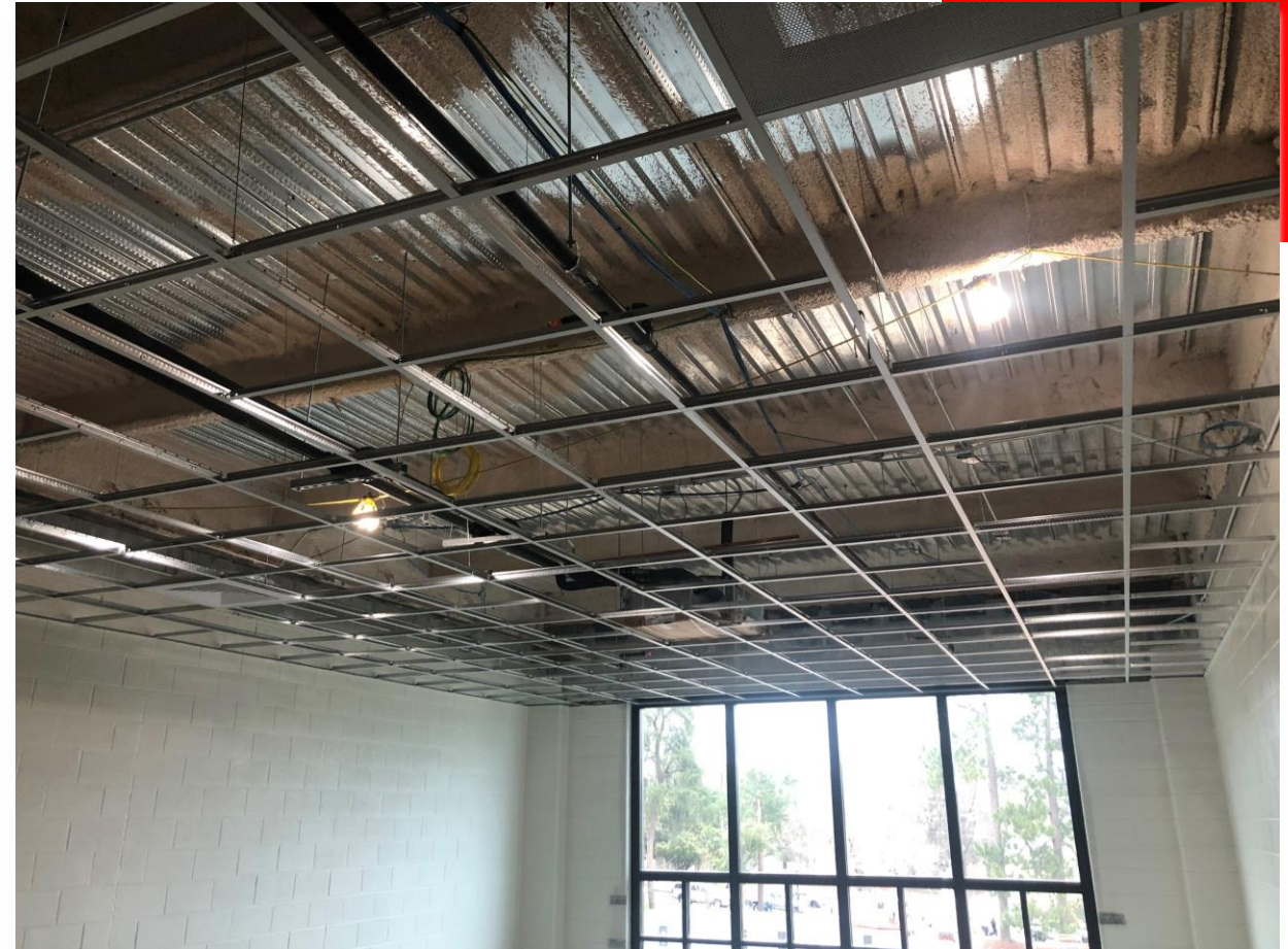
ACT Ceiling Progress 3 rd Floor